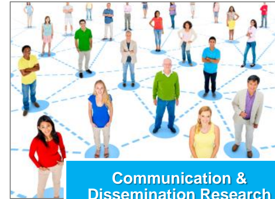
Communication & Dissemination Research