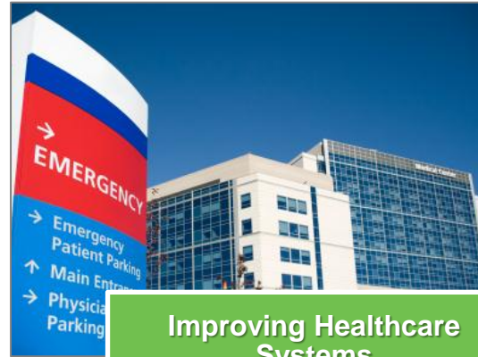
Improving Healthcare Systems