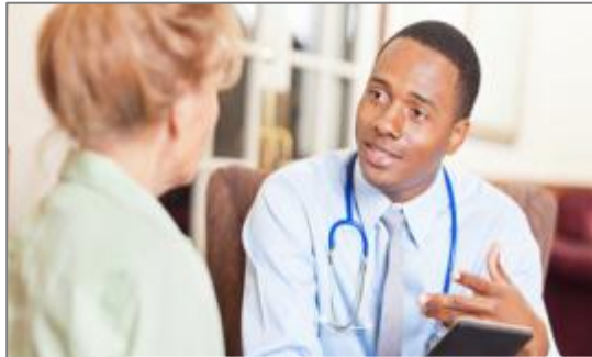
Assessment of Prevention, Diagnosis and Treatment Options